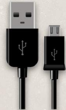
MICRO USB CABLE